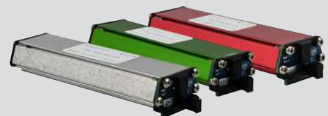
From left to right: refrigerant sensor 724-701-G1, CO 2 sensor 724-701-G2, and flammable refrigerant sensor 724-701-G3.